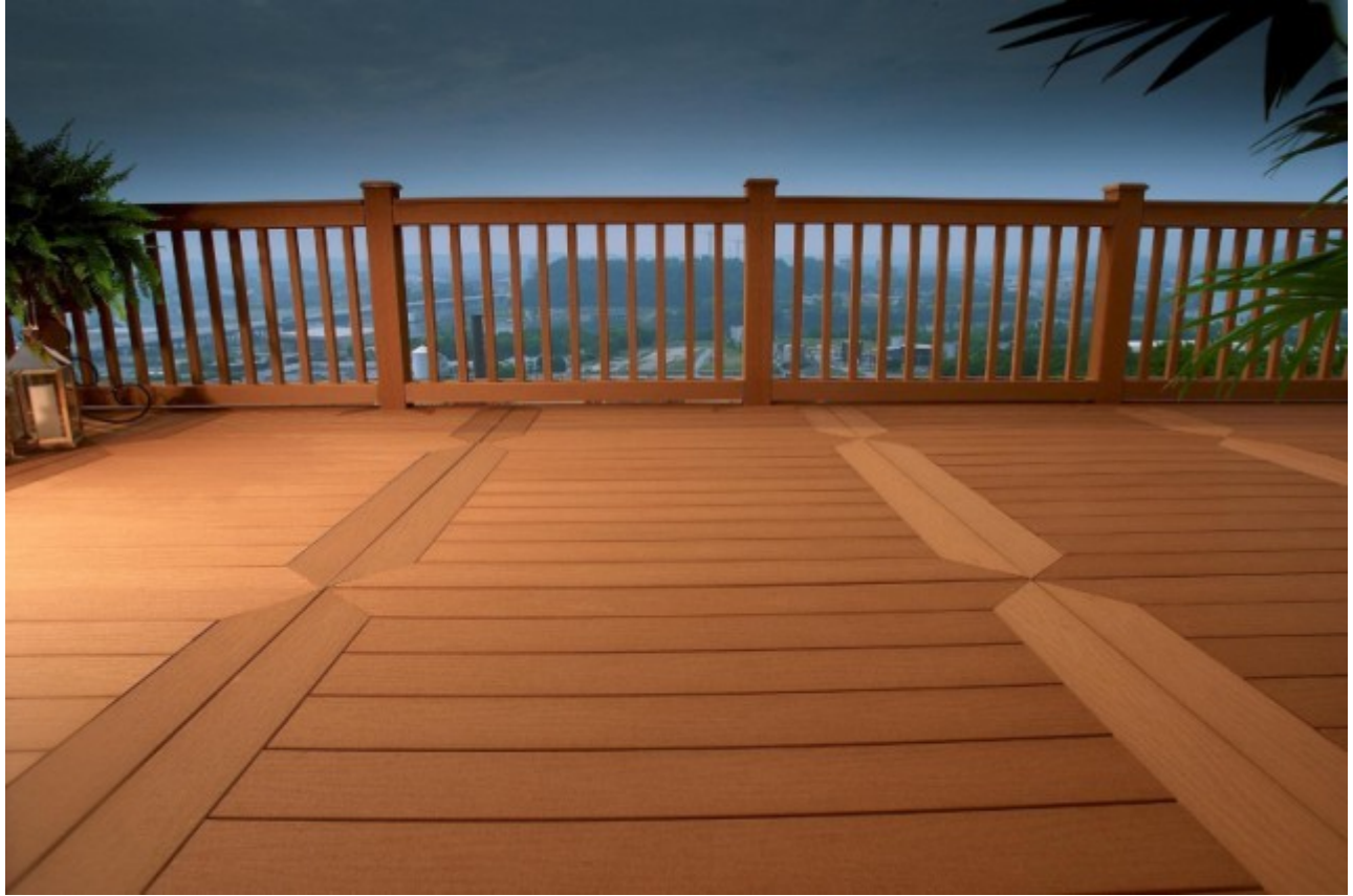
Photo of installed decking

Consumer Contact: For additional information, contact LP toll-free at (888) 325-1184 between 6 a.m. and 5 p.m. PT Monday through Friday, or visit the firm's Web site at www.deckingnotice.com