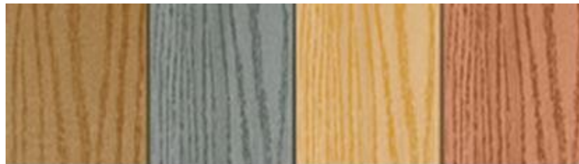
Tuscan Walnut/ Chestnut Driftwood Grey/ Greystone Pacific Cedar Western Redwood

CPSC is still interested in receiving incident or injury reports that are either directly related to this product recall or involve a different hazard with the same product. Please tell us about it by visiting https://www.cpsc.gov/cgibin/incident.aspx